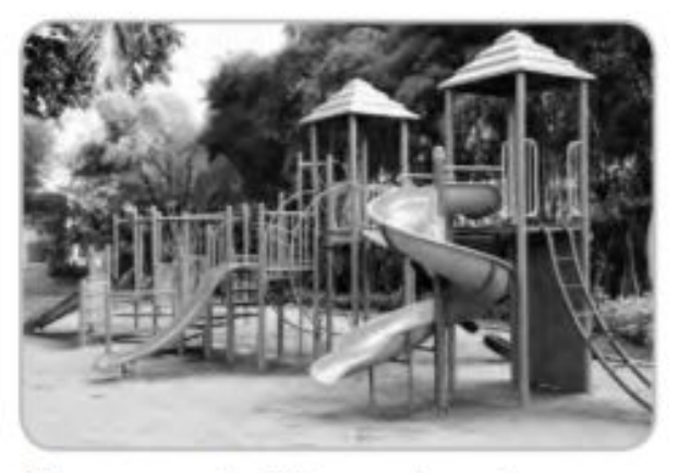
Playground with a soft surface

But my opinion is that the most important thing to do is to have adults watching all the time. Adults can teach rules for playground